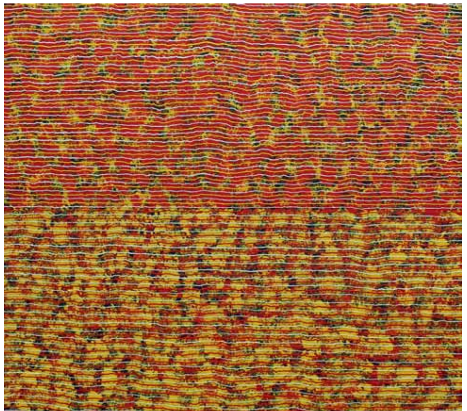
2 AM 13658/17 Sam Juparulla Wickman Wulu Pooku (Fire Ceremony) 2017 Acrylic on canvas 1935 x 1730mm $6500

This painting is part of secret men's business. It describes the fire ceremony - as part of the male initiation process.