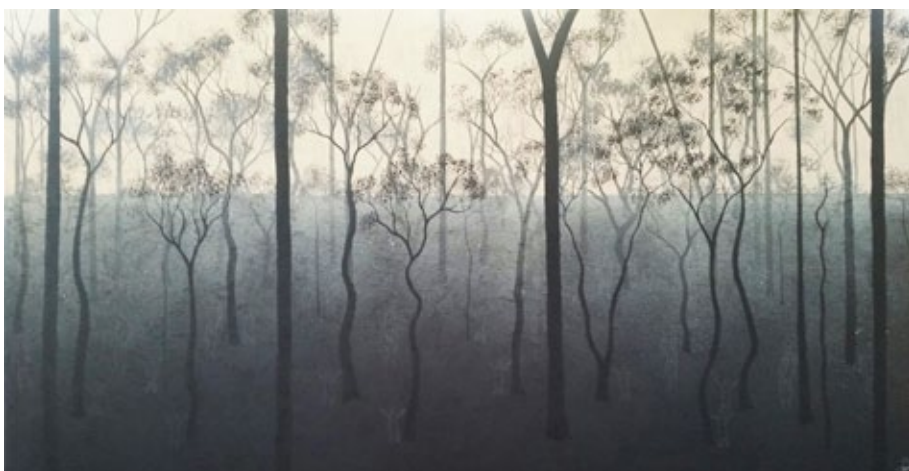
3AM 13597/17 Mick Quilliam Peti-Ana (Old Spirits) 2017 Natural oches & fixative on canvas 1980 x 1020mm $8500