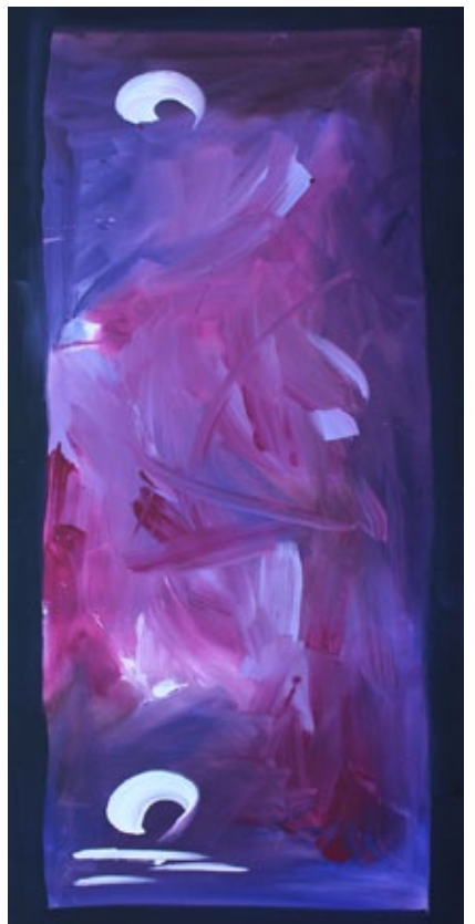
5 AM 11337/15 Anjolu Heather Umbagai Moon over Yarlun 2002 Acrylic on canvas 990 x 2395mm $4500