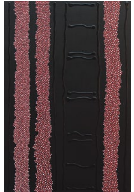
4 AM 13600/17 Julian Oates Sarah's Healix 2016 Acrylic on Belgian linen 600 x 900mm $1850