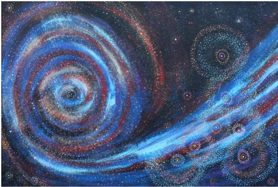
1AM 12708/16 Alma Nungarrayi Granites Yanjiripiri/Napaljarri-Warnu Star & Seven Sisters 2016 Acrylic on Belgian linen 1830 x 1220mm $7160