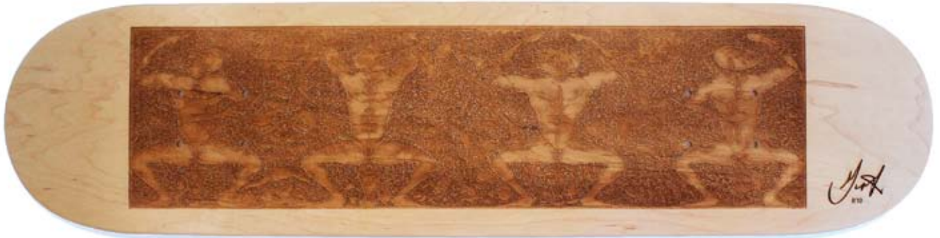
SDAT016/08 Alick Tipoti Gabu Aimai Mabaigal 08/10 2008 Laser Cut Skatedeck 800 x 200 x 25mm $750