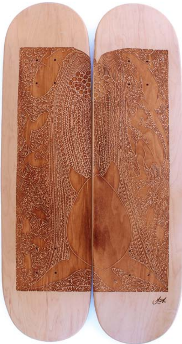
SDAT039/04 Alick Tipoti Waru Thurul 4/10 2008 Laser Cut Skatedeck 800mm H x 200mm W x 25mm D (each) $1500