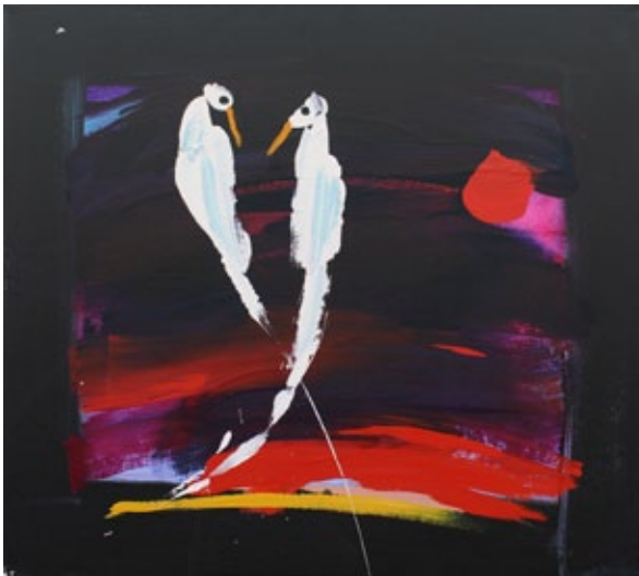
AM 11257/15 Anjolu Heather Umbagai Gurrong Kaling 2002 Acrylic on cotton 710 x 640mm $1200