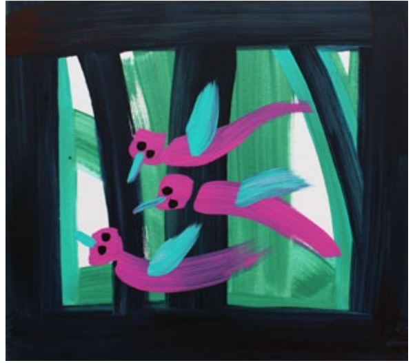
AM 11256/15 Anjolu Heather Umbagai Parrots 2002 Acrylic on cotton 670 x 600mm $1200