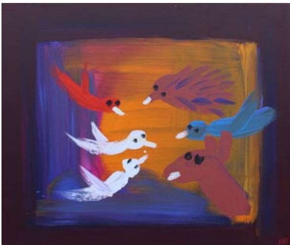
AM 11259/15 Anjolu Heather Umbagai Untitled (Birds & Beasts) 2002 Acrylic on cotton 710 x 600mm $1200