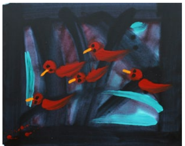
AM 11260/15 Anjolu Heather Umbagai Marrirri (Red Wing Parrots) 2002 Acrylic on cotton 710 x 570mm $1200