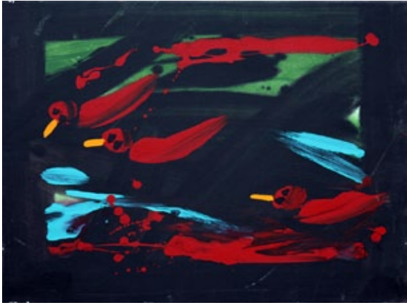
AM 11149/15 Anjolu Heather Umbagai Marrirri (Red Wing Parrots) 2002 Acrylic on canvas 715 x 560mm $1200

A SELECTION FROM OUR “ANJOLU’S BIRDS” EXHIBITION