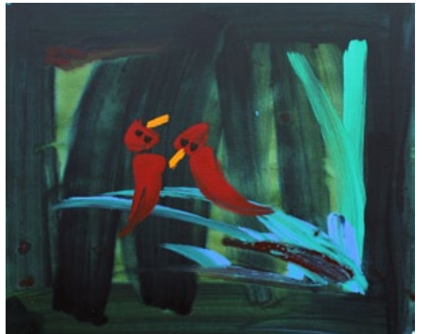
AM 11258/15 Anjolu Heather Umbagai Marrirri (Red Wing Parrots) 2002 Acrylic on cotton 710 x 575mm $1200