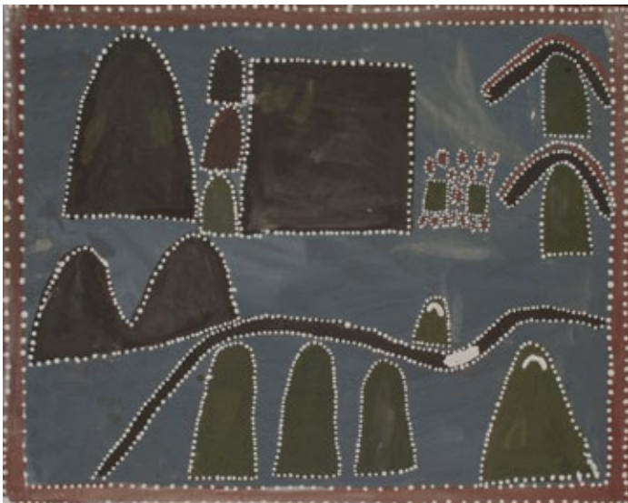
AM 11929/15 Queenie McKenzie Bowerbird Dreaming 1998 Natural earth pigments and binder on Artist Board 76 x 60cm $6636