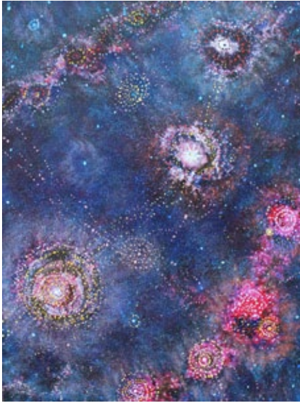
AM 12807/16 Alma Nungarrayi Granites Yanjiripirri/Napaljarri-Warnu Star & Seven Sisters 2012 Acrylic on Belgian linen 1220 x 910mm $3200