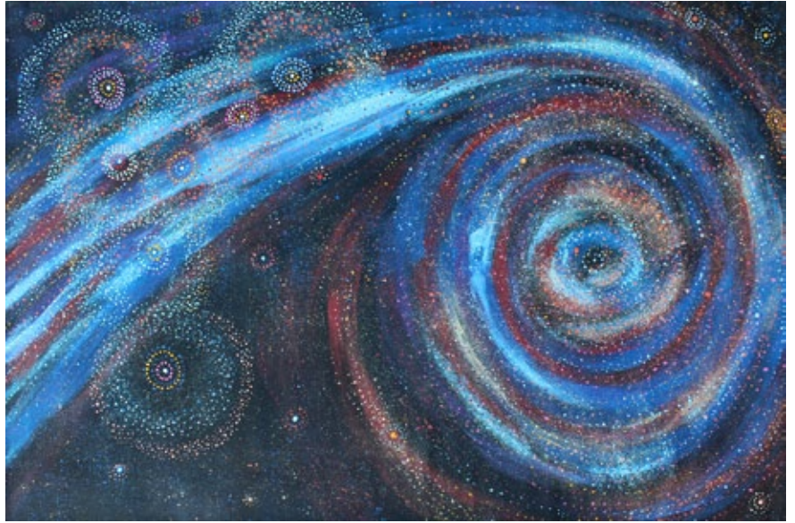
AM 12708/16 Alma Nungarrayi Granites Yanjiripirri/Napaljarri-Warnu Star & Seven Sisters 2016 Acrylic on Belgian linen 1830 x 1220mm $7160

For more about this amazing artist check out our ART MOB video at artmob.com.au