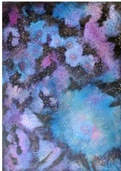
AM 12806/16 Alma Nungarrayi Granites Yanjiripirri/Napaljarri-Warnu Star & Seven Sisters 2011 Acrylic on Belgian linen 1070 x 760mm $2110