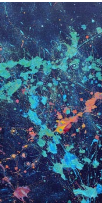
AM 12809/16 Alma Nungarrayi Granites Yanjiripirri/Napaljarri-Warnu Star & Seven Sisters 2013 Acrylic on Belgian linen 910 x 460mm $990