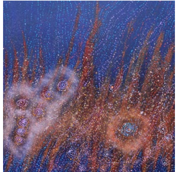
AM 12804/16 Alma Nungarrayi Granites Yanjiripirri/Napaljarri-Warnu Star & Seven Sisters 2012 Acrylic on Belgian linen 1070 x 1070mm $3300