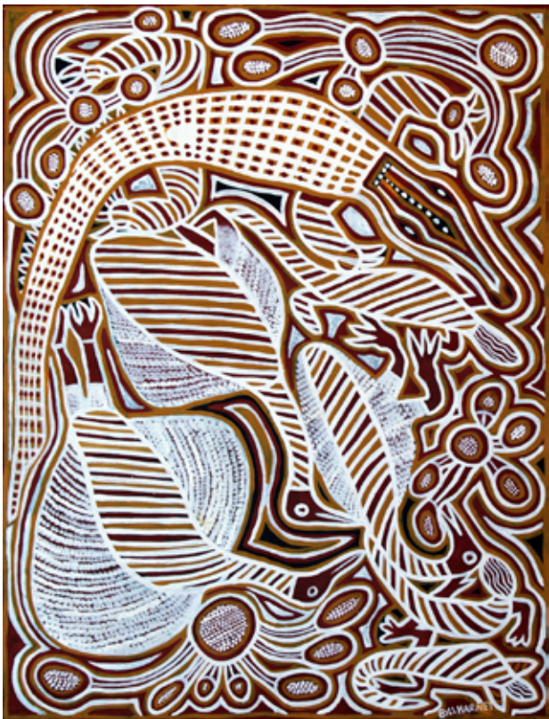
AM 12378/16 Bill Harney Warritja (Crocodile) Dreaming 2016 Natural ochres on Berge linen 900 x 1180mm $3900