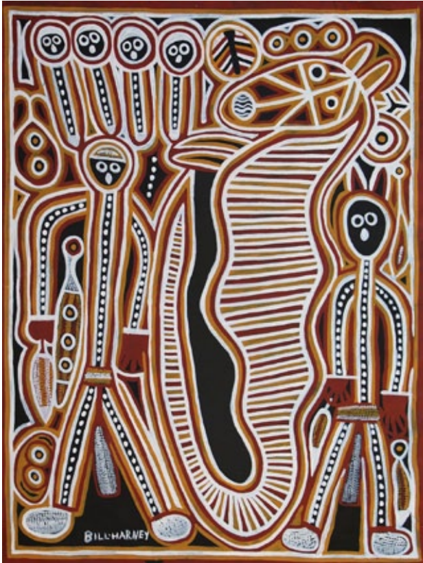
AM 12376/16 Bill Harney Gorondolmi - Rainbow Serpent 2016 Natural ochres on Berge linen 900 x 1200mm $3900