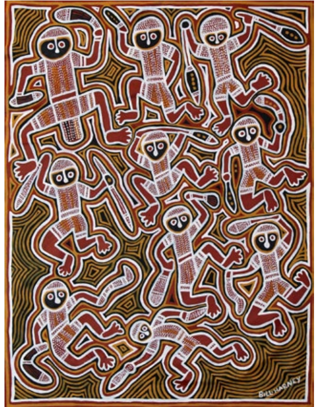
AM 12377/16 Bill Harney Gilling Gilling's 2016 Natural ochres on Berge linen 895 x 1180mm $3900