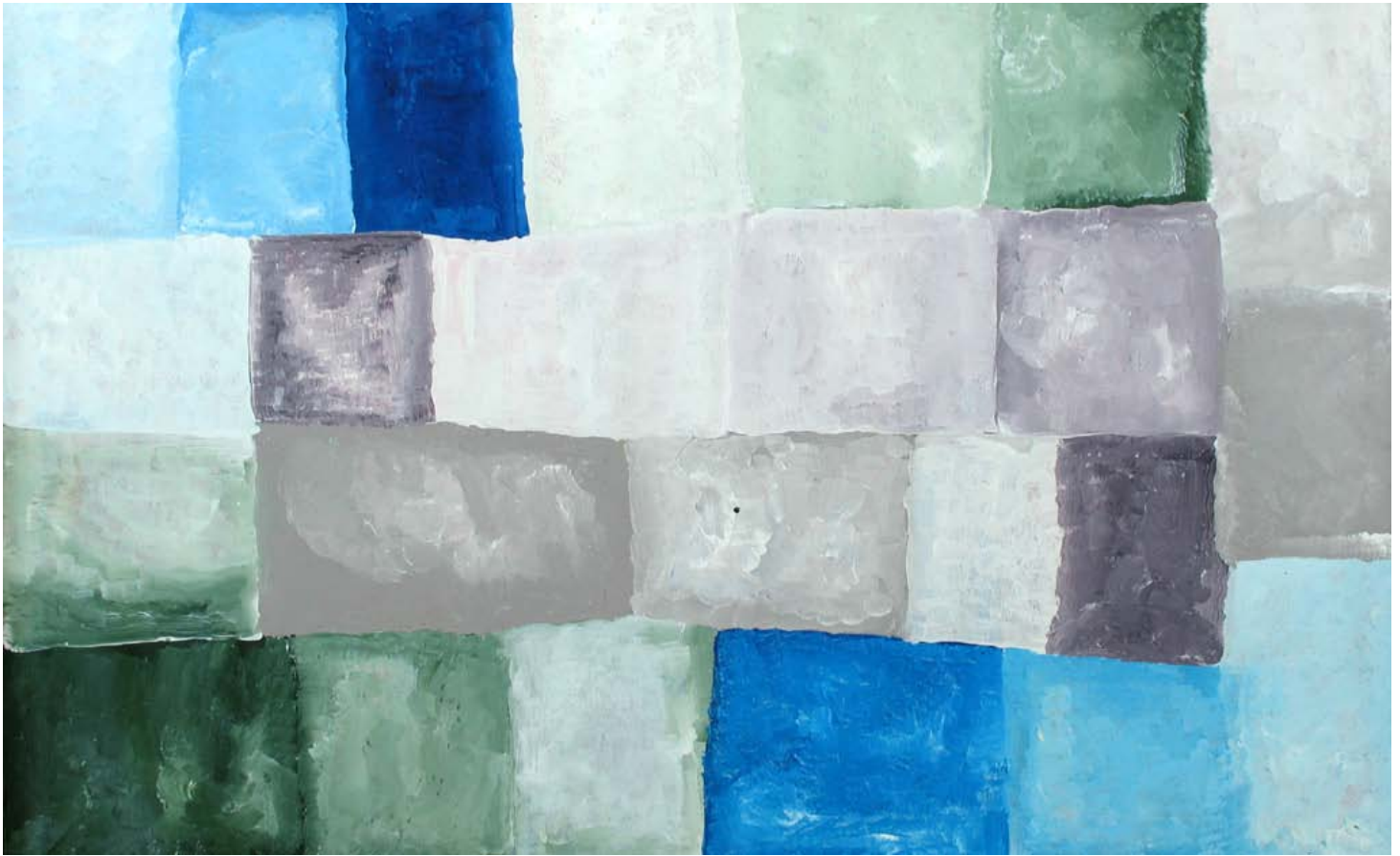
AM 5422/07 Dinny Tjampitjinpa Nolan Mikanji Water Dreaming 2007 Acrylic on Belgian linen 1820 x 1220mm WAS $12000 NOW: $6500