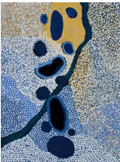
AM 9186/12 Lu Lu Trancollino Dungi Valley - Ord River 2012 Acrylic on canvas including resale royalty 1200 x 900mm WAS $3045 NOW: $2200