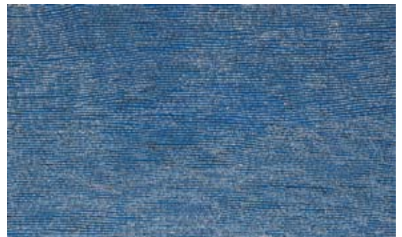
AM 5678/08 Willy Tjungurrayi Tingari 2008 Acrylic on Galacia linen 1210 x 2000mm WAS $18000 NOW: $8500