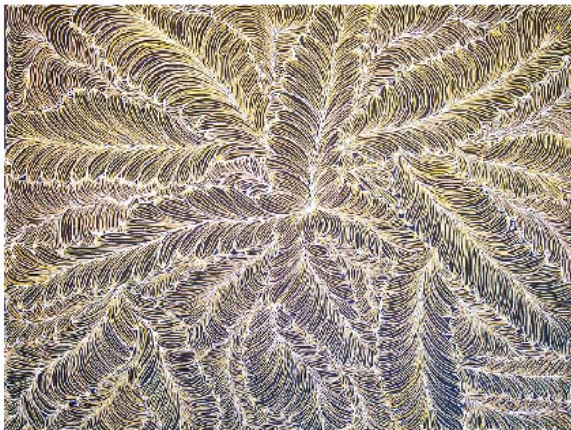
AN 18310+ Rosemary Petyarre Anzacite - Bush Yam 2004 Acrylic on Belgian linen 500 x 1200mm $2400