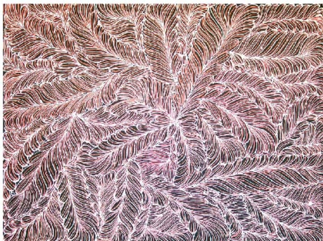
AN 18320+ Rosemary Petyarre Anzacite - Bush Yam 2004 Acrylic on Belgian linen 500 x 1200mm $2400