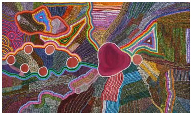
AM 10578/14 Janet Nyunmitji Forbes Pulypal 2014 Acrylic on canvas 1020 x 610mm $3465 including resale royalty