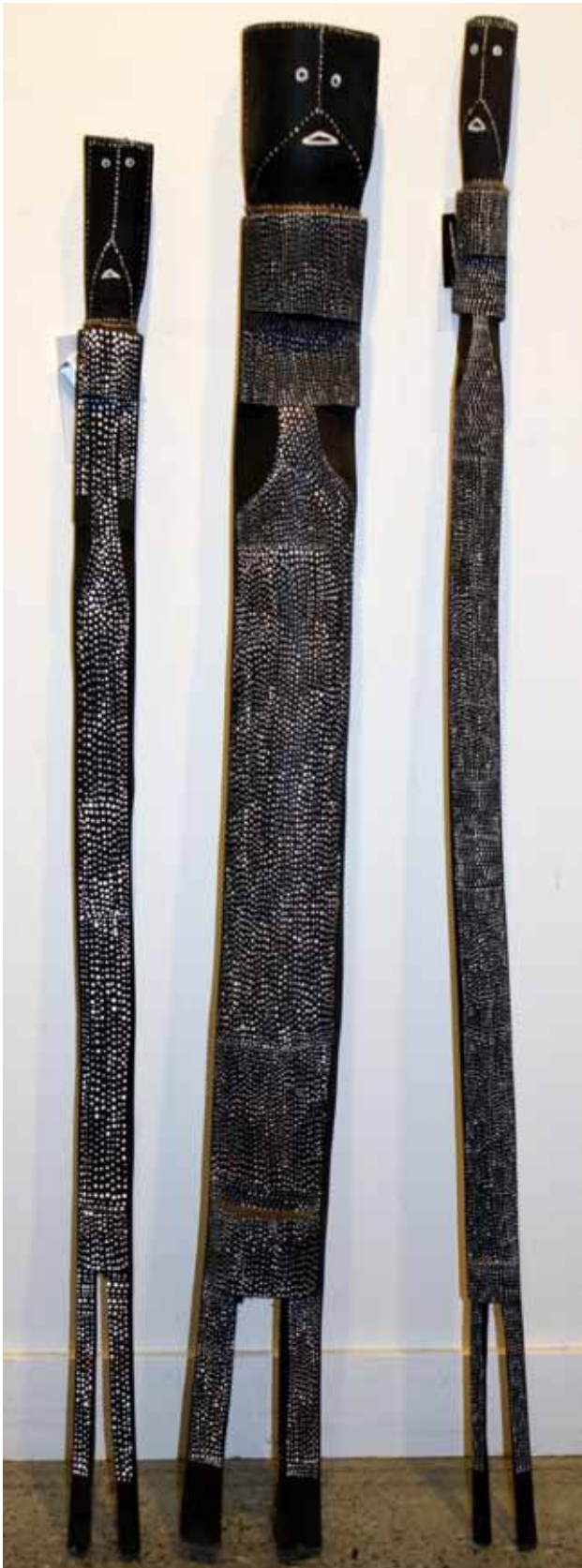
Eddie Kerry Aning-Mirra Aning-Mirra Mimih Spirit 2014 Natural ochre & PVA fixative on wood Left AM 10476/14 105cm high $330 Middle AM 10474/14 112cm high $440 Right AM 10478/14 116cm high $350