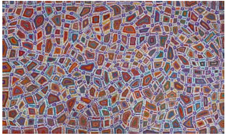
AM 10573/14 Lynette Nangala Singleton Ngapa Jukurpa Water Dreaming - Puyurru 2014 Acrylic on Belgian linen 1520 x 910mm $2541 including resale royalty