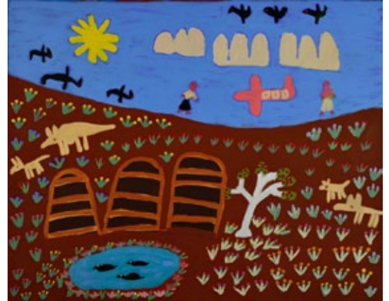
AM 9987/13 Christabella Briscoe Untitled 2013 Acrylic on canvas 1060 x 1320mm $1733