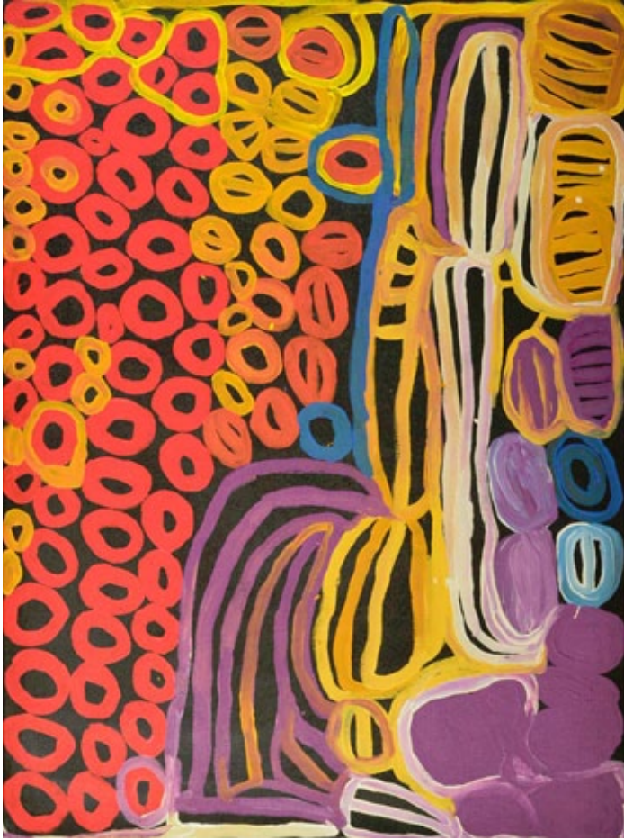
AM 9988/13 Anmanari Brown Palpatjata 2013 Acrylic on linen 1360 x 900mm $5985