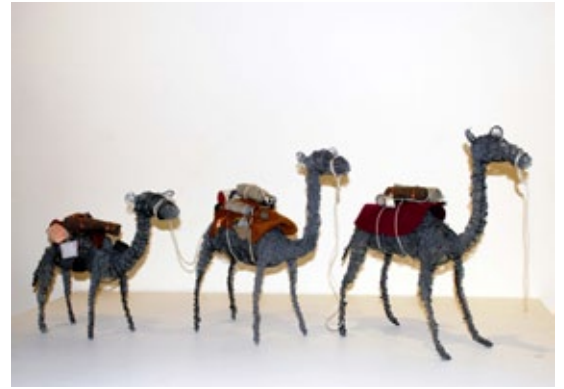
AM 9986/13 Johnny Young Camel Train 2012 Galvanised wire, fabric, leather, copper & steel 41x11x49 cm / 45x13x50cm / 32x12x49cm $2126