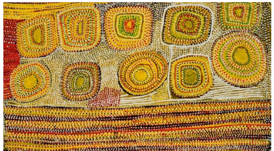
AM 9985/13 Minyawwe Miller Sand Hill Country Walpururu 2013 Acrylic on linen 910 x 500mm $3308