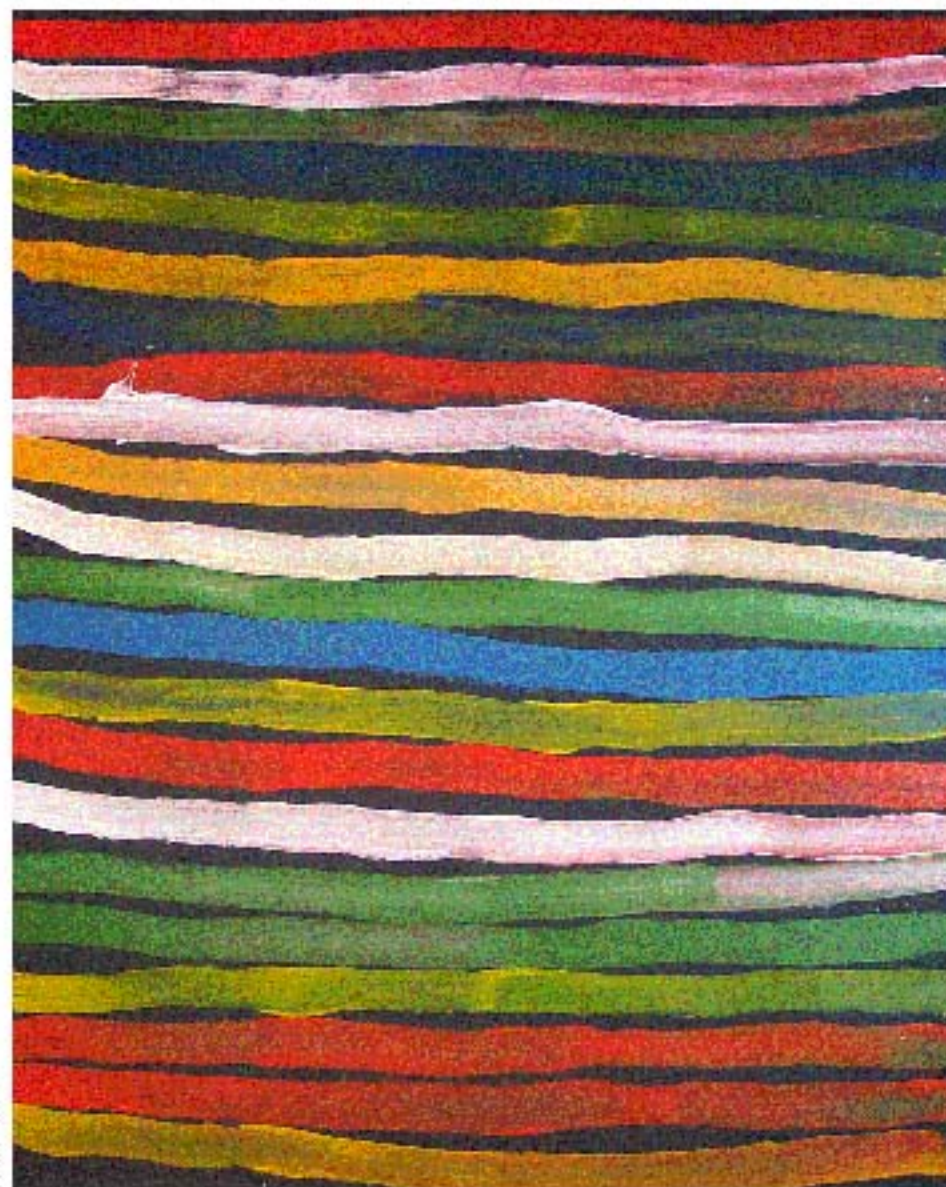
AM 204804 Body Painting 2004 Acrylic on Galada linen 520 x 1230mm $5500