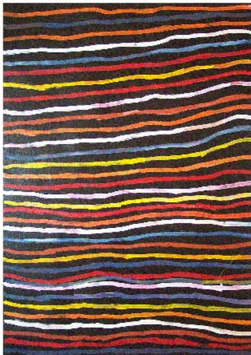
AM 204704 Body Painting 2004 Acrylic on Galada linen 520 x 1230mm $5500