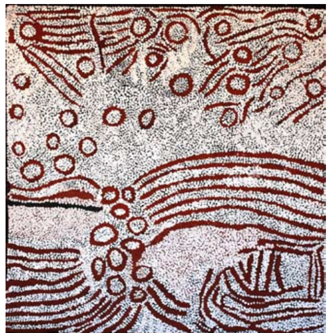
AM 6001/08- from Kayili Artists, Patjarr Nyumitja Laidlaw Kuriella 2008 Acrylic on linen 1020 x 1020mm $6600