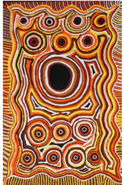
AM 6000/08 - from Kayili Artists, Patjarr Betty West Old Well - Warburton 2008 Acrylic on linen 1020 x 1520mm $2400