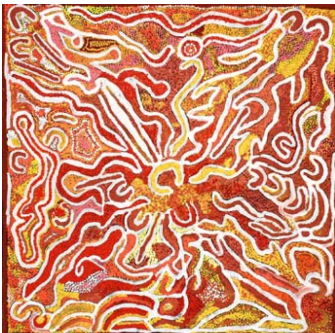
AM 5999/08 - from Kayili Artists, Patjarr Christine West Untitled 2008 Acrylic on linen 1020 x 1020mm $2400

This is a popular dreamtime story of seven ladies being chased through the desert by one man. There are numerous scenarios as these ladies travel around. Eventually they rise up into the sky and form the Pleiades, a group of seven stars seen in the southern skies. There are many variations of this story.