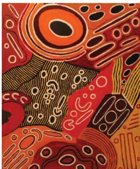
AM 4211/06 Malcolm Jagamarra White Cockatoo 2006 Acrylic on canvas 970 x 1170mm $2500