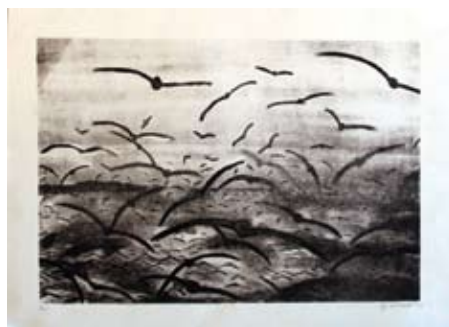
AM 3357/05 Allan Mansell Birds At Dusk 1/4 2005 Lithograph 500 x 700mm $750