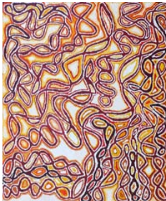
AM 9771/13 Gayle Napangardi Gibson Ngalyipi Jukurrpa (Snake Vine Dreaming) 2013 Acrylic on linen 910 x 760mm $1292 including resale royalty