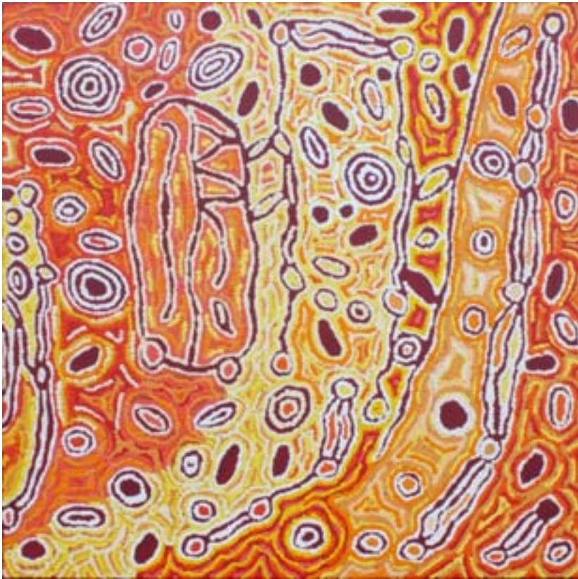
AM 9769/13 Magda Nakamarra Curtis Lappi Lappi Jukurrpa (Lappi Lappi Dreaming) 2013 Acrylic on linen 910 x 910mm $1544 including resale royalty