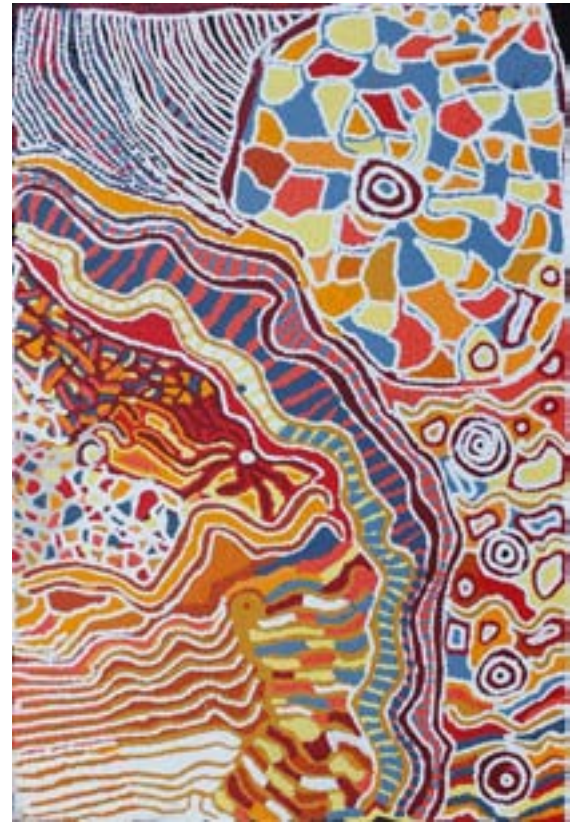
AM 9772/13 Mary Napangardi Gallagher Mina Mina Jukurrpa (Mina Mina Dreaming) 2013 Acrylic on linen 910 x 610mm $1229 including resale royalty