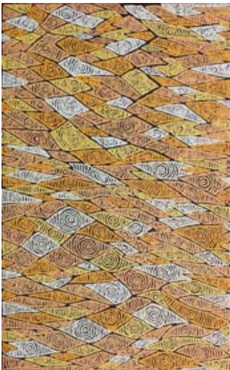
AM 9763/13 Pauline Napangardi Gallagher Mina Mina Jukurrpa (Mina Mina Dreaming) 2013 Acrylic on linen 1220 x 760mm $1733 including resale royalty