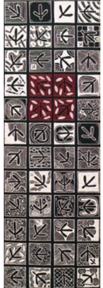
AM 2750/05 Emu Dreaming 2005 Acrylic on cotton duck 300 x 900mm $1900