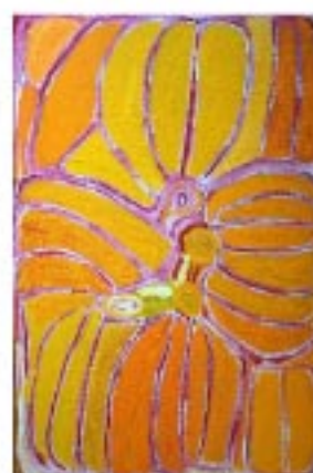
AM 1603/04 Miyaki 2004 1000 x 1500mm $19500