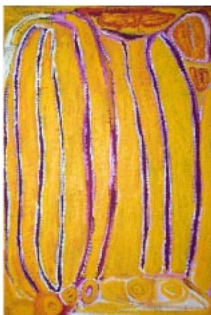
AM 1527/04 Wentji 2003 1200 x 800mm $14000