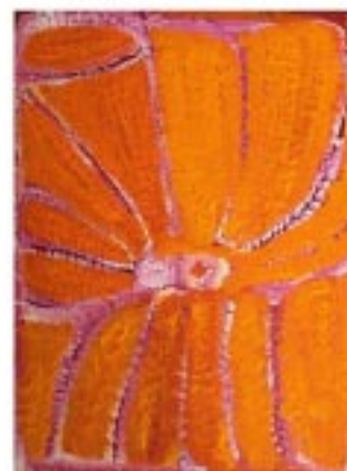
AM 1612/04 Yardwarra 2004 Acrylic on linen 600 x 450mm $3950