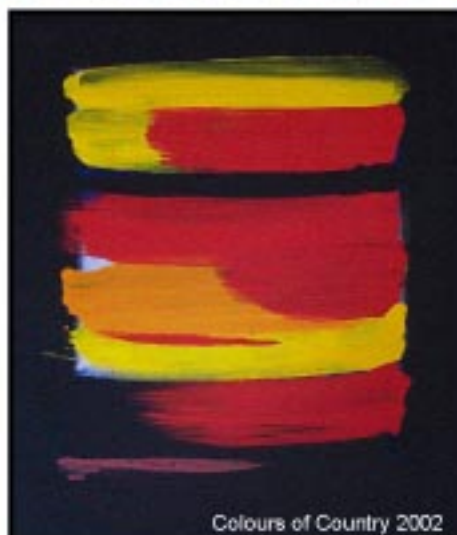
Colours of Country 2002