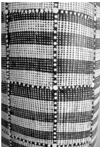
AM 6853/10 Susan Marawarr Hollow Log (Lorrkon) 2009 Stringybark (eucalyptus tetradonta) with ochre pigment & PVC fixative 1855 x 230 x 210mm $3650