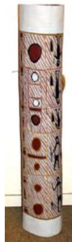
AM 3872/06 Jimmy Ngaiakum Lorrkon, Hollow Log 2006 Stringybark (eucalyptus tetradonta) with ochre pigment & PVC fixative 1390 x 240mm $4200