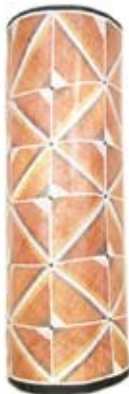
AM 6856/10 Ivan Namirrkki Hollow Log (Lorrkon) 2009 Stringybark (eucalyptus tetradonta) with ochre pigment & PVC fixative 803 x 272 x 250mm $2540