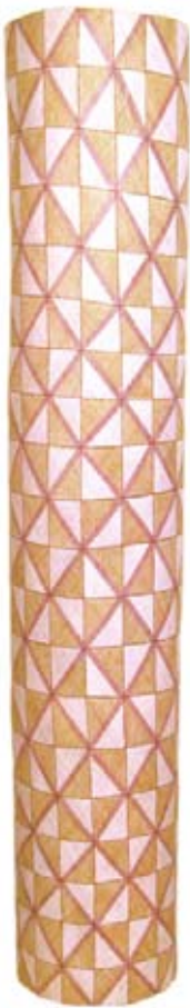
AM 6855/10 Bronwyn Kelly Hollow Log (Lorrkon) 2009 Stringybark (eucalyptus tetradonta) with ochre pigment & PVC fixative 1440 x 250 x 255mm $5800

At first light on the final morning of the Lorrkon ceremony, the men appear, coming out of their secret bush camp carrying the pole towards the women's camp. The two groups call to each other using distinct ceremonial calls. The women have prepared a hole for the pole to be placed into and when it is stood upright, women in particular kinship relationships to the deceased dance around the pole in a jumping/shuffling motion. The Lorrkon is then often covered with a tarpaulin and left slowly to decay.