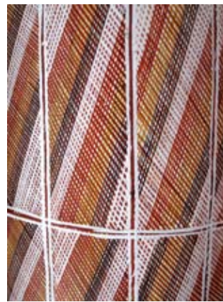
AM 3350/05 Timothy Wulanbirr Hollow Log Coffin 2005 Stringybark (eucalyptus tetradonta) with ochre pigment & PVC fixative 1360 x 140mm $6250