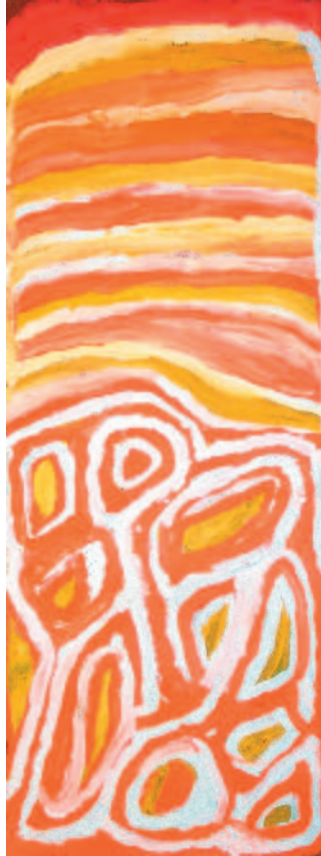
AM 2341/05 Nora Wompi Nungurrayi Kartu Kartu 2004 Acrylic on canvas 800 x 300mm $850