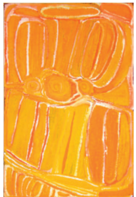
AM 2344/05 Eubena Nampitjin Mungai 2004 Acrylic on linen 1500 x 1000mm $22500