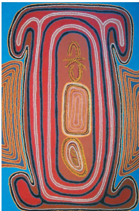
AM 2340/05 Pauline Sunfly Nangala Goowaree 2004 Acrylic on canvas 1200 x 800mm $4000