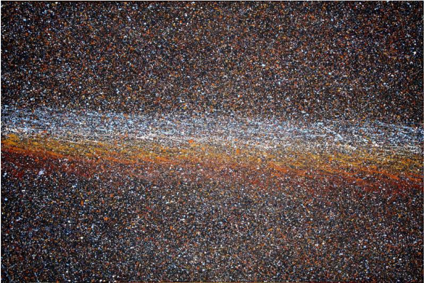
AM 7488/10 Karina Coombes Tapalinga (Tiwi Star - Night Sky) 2010 Ochre & acrylic on canvas 120 x 80cm $1650 It is a Tiwi story of the morning star . The morning star is a beautiful woman that guides the people at night.