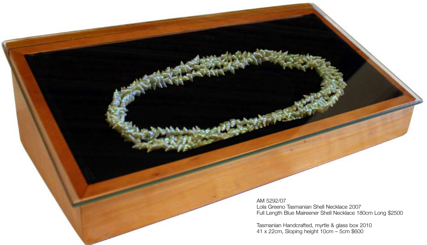
AM 5292/07 Lola Greeno Tasmanian Shell Necklace 2007 Full Length Blue Maireener Shell Necklace 180cm Long $2500