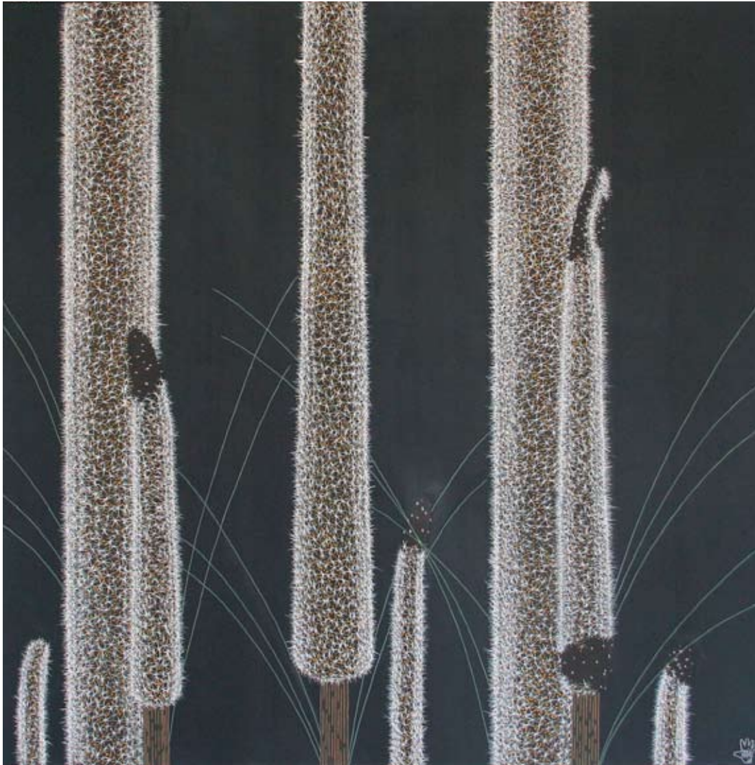
3 AM 6737/09 Mick Quilliam Grasstree Flower Spikes 2009 Acrylic on cotton 1220 x 1220mm $7200