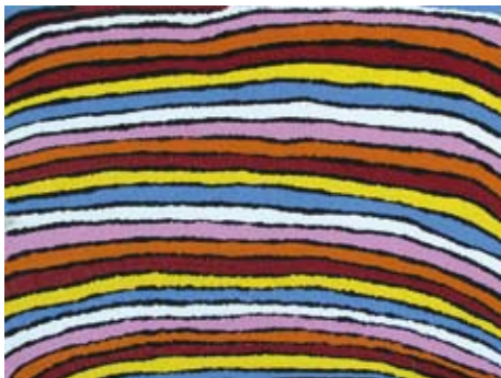
Peggy Nampijinpa Brown Ngapa Jukurrpa (Water Dreaming) 2006 Acrylic on cotton 610 x 460mm $490