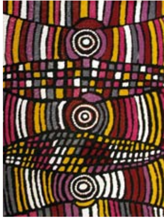
Melissa Nungarrayi Larry Yumari Jukurrpa (Yumari Dreaming) 2007 Acrylic on cotton 610 x 460mm $500