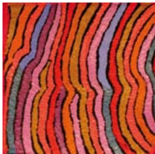
Peggy Nampijinpa Brown Warlukurlangu Jukurrpa (Fire Country Dreaming) 2007 Acrylic on linen 300 x 300mm $250