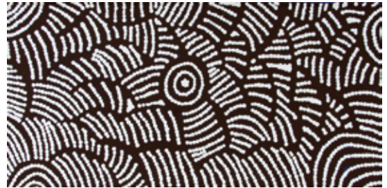
Melissa Nungarrayi Larry Yumari Jukurrpa (Yumari Dreaming) 2007 Acrylic on cotton 610 x 300mm $350