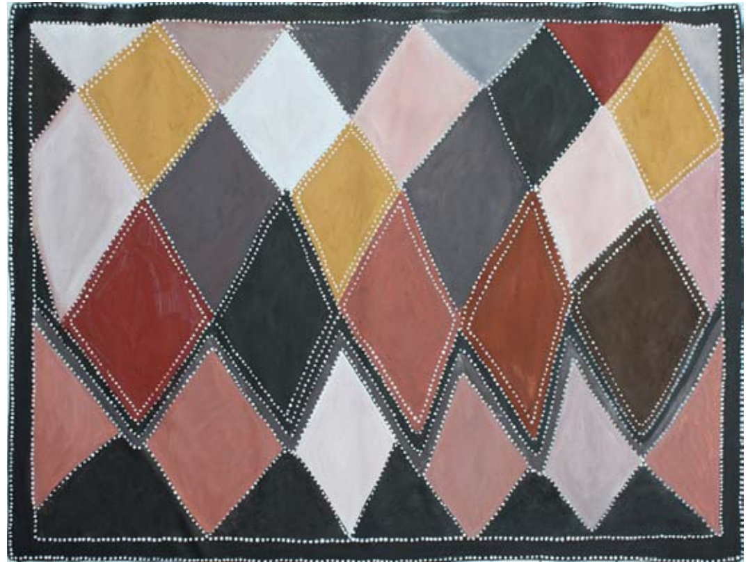
AM 8068/11 Queenie McKenzie Hills of Texas Downs 1995 Natural ochre & pigment on linen 1520 x 2000mm $75000

Bishop Jobst from Broome. Holy Spirit corroboree. Baby Jesus in the shade and God with beard. Hills of Texas Station top. Painted at the Warmun pensioners unit.