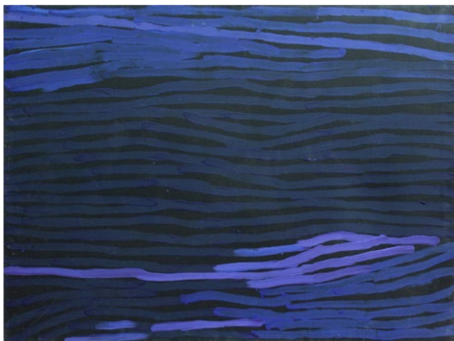
4 AM 10979/15 Minnie Pwerle Awelye Atnwengerrp 2004 Acrylic on Galicia linen 910 x 1220mm $15400