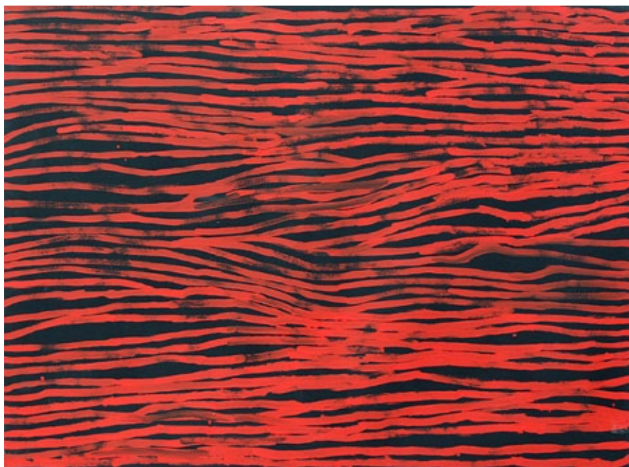
1 AM 10974/15 Minnie Pwerle Awelye Atnwengerrp 2004 Acrylic on canvas 900 x 1220mm $15400