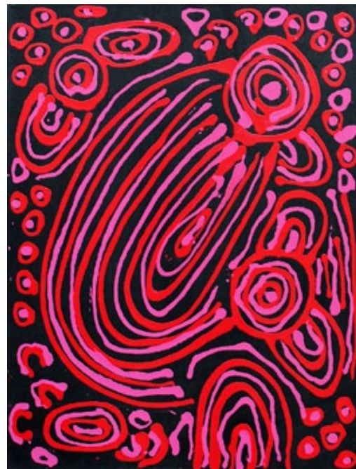
3 AM 10982/15 Barbara Weir Awelye 2010 Acrylic on Belgian linen 910 x 1200mm $5500