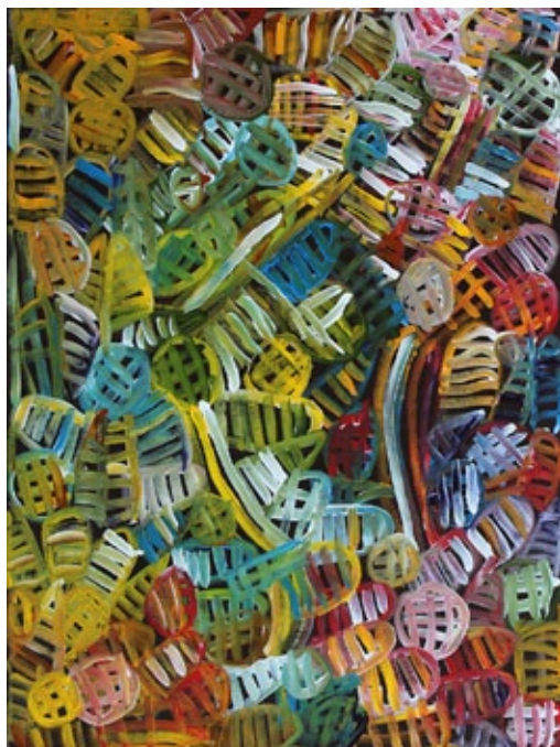
2 AM 10983/15 Emily Pwerle Awelye Atnwengerrp 2010 Acrylic on linen 905 x 1205mm $4600