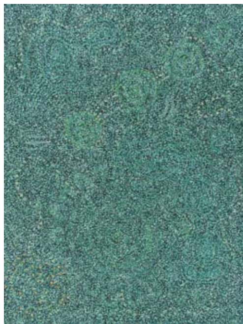
2 AM 5263/07 My Mothers Country 2007 Acrylic on canvas 1210 x 910mm $7900