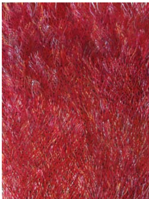
1 AM 5259/07 Grass Seed Dreaming 2007 Acrylic on canvas 1210 x 910mm $7900

Barbara is a versatile and passionate artist whose love for the country is reflected in each canvas she paints. She is highly skilled in the use of dot work shown in her depictions of 'My Mothers Country', and is ingenious in her use of lines and texture as shown in 'Grass Seed' dreamings.