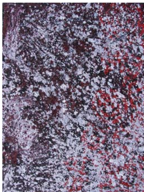
4 AM 5268/07 Creation of My Mother's Country 2007 Natural ochres & acrylic on canvas 1210 x 910mm $7700