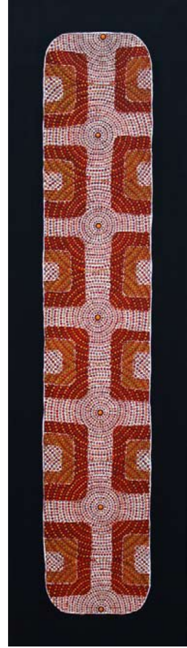
AM 7172/10 Sam Juparulla Wickman Fire Dreaming through the MacDonnell Ranges 2010 Acrylic on canvas 1715 x 475mm $3300