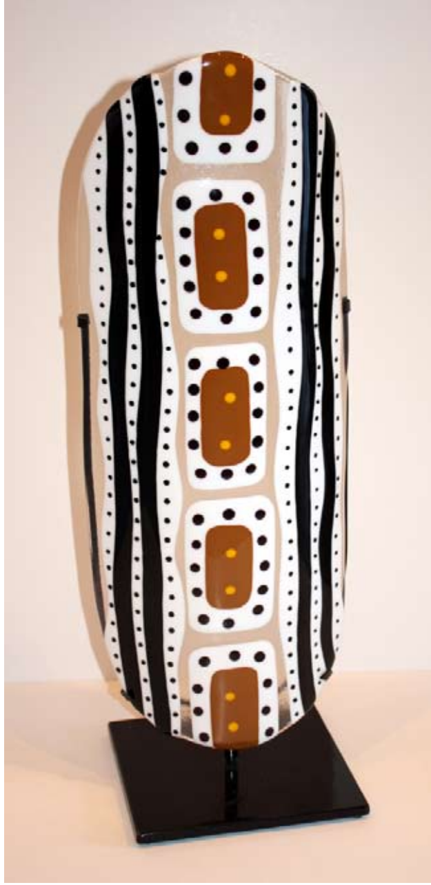
AM 7175/10 Sam Juparulla Wickman Willy Wagtail 2010 Compatible System 69 Fused Glass on black powder coated steel frame 590mm x 260mm $2200