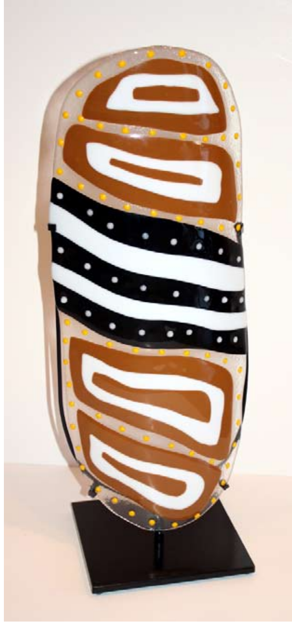
AM 7177/10 Sam Juparulla Wickman Black & White Ceremony through the MacDonnell Ranges 2010 Float Glass Painted and fused with glass enamel mounted on black powder coated steel frames 590 x 260mm $2200