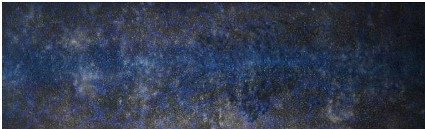
Alison Napurrula Muita Night Sky at Haasts Bluff 709 x 204cm $26,500

In this work Alison portrays the brilliant display of celestial objects visible on the clearest of nights at Haasts Bluff.