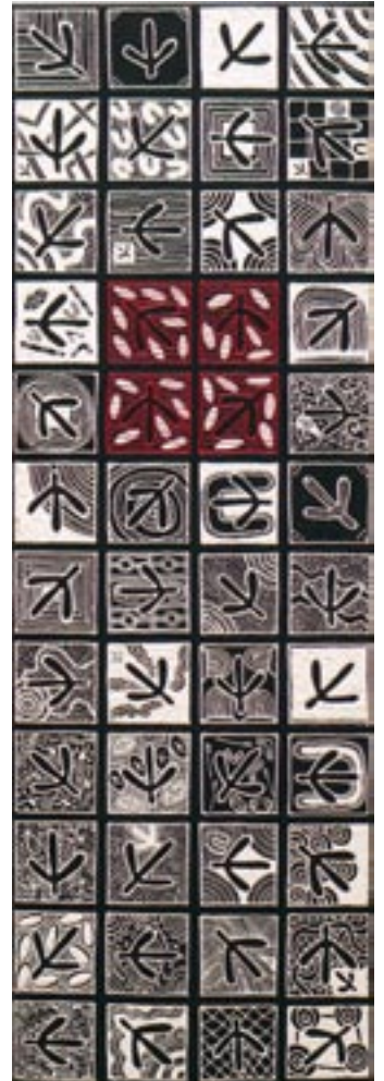
AM 2750/05 Emu Dreaming 2005 Acrylic on cotton duck 300 x 900mm $1900