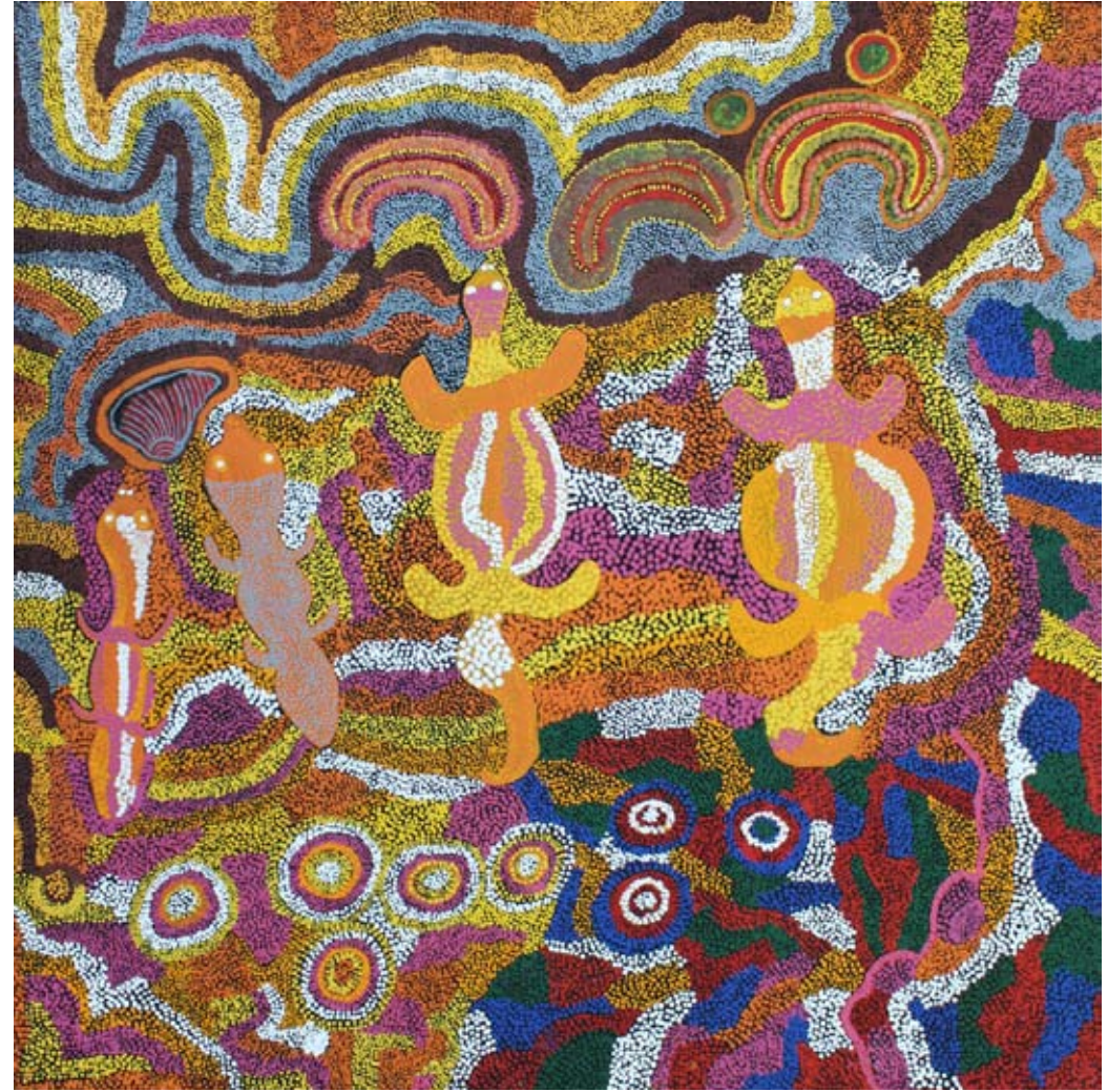
AM 7281/10 Ungakini Tjangala Ngintaka Kutjara 2009 Acrylic on linen 1500 x 1500mm $2900

Favourite bush foods of Anangu Pitjantjatjara include maku (witchetty grubs), ngintakaku ngampu - (goanna eggs), bush plum (arrnguli), tjala (honey ants), kampurarpa (bush tomatos), wayanu (quondongs) and ili (bush figs). Bush foods were until comparatively recently the primary sustenance for Anangu Pitjantjatjara. Many bush foods are still gathered regularly almost exclusively by women, thus they feature strongly in women's mark making. Women learn the art of gathering each of the foods from a young age and much inma (ceremony) relates to these practises and the maintenance of supply.