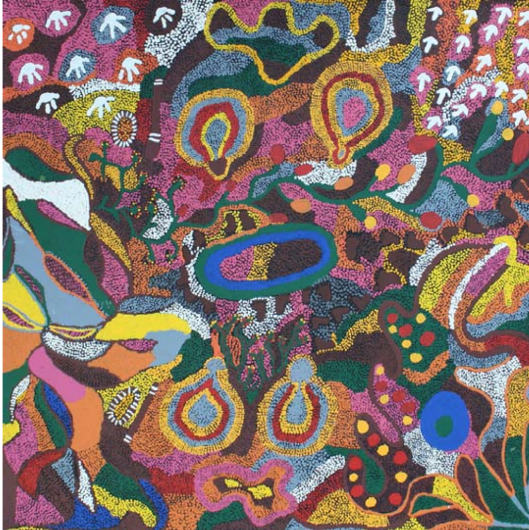
AM 7282/10 Ungakini Tjangala Mai Putitja / Bush Foods 2009 Acrylic on linen 1210 x 1210mm $2400

the same year. My husband passed away in 2002. I first started to make art in 2002. First, mukata (beans) from emu feathers, then I made figures from tjanpi (Spinifex grass) and now I am painting on canvas - for the first time". Ungakini's paintings have been shown in many group exhibitions since 2002 and feature in a good number of private and institutional collections in Australia and overseas.