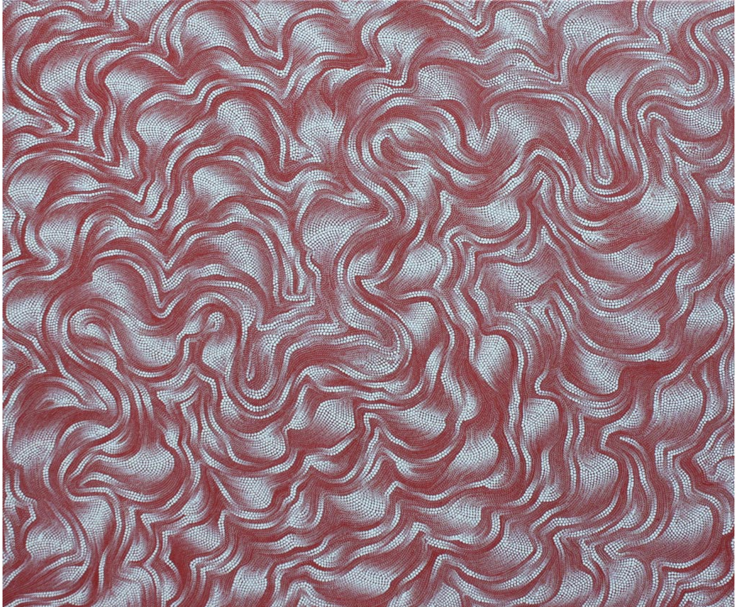
AM 7970/11 Fabrianne Nampitjinpa Peterson Wangu: Bush Damper Dreaming 2011 Acrylic on Galicia linen 1495 x 1240mm $12000

Fabrianne explains that her painting is about the Wangunu seeds that the women collect for bush tucker. The women in old times would collect the Wangunu (woollybutt) in big bunches and carry them back to camp where they would burn the grasslike material on the ashes of a slow fire. This would dry out the remaining seeds that would then be ground to a flour. This flour is mixed with water and a little salt and baked in the ground to make damper (bush bread). The imagery reflects the feeling of the seeds in a coolamon or dilly bag flowing around your hand.