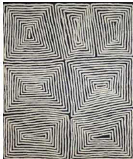
AM 2237/04 Tingari 2004 Acrylic on Belgian linen 760 x 915mm $4800