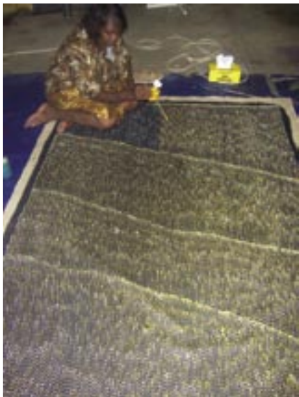
AM 3459/05 Lilly Kelly Napangardi Sandhills at Nyrripi 2005 Acrylic on Belgian linen 1215 x 1820mm $18000