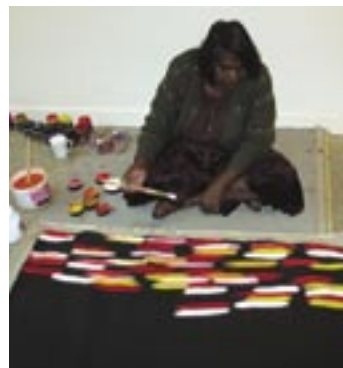
AM 3281/05 Evelyn Pultara Bush Yam 2005 Acrylic on linen 1100 x 1950mm $6000