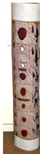
AM 3872/06 Jimmy Ngaiakum Lorrkon, Hollow Log 2006 Stringybark (eucalyptus tetradonta) with ochre pigment & PVC fixative 1390 x 240mm $4200