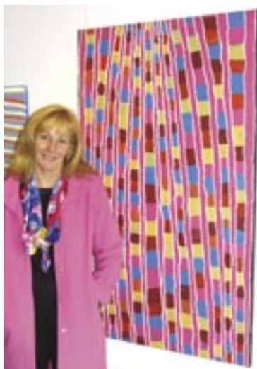
AM 2171/04 Water Dreaming 2004