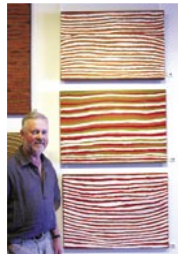
AM 3161/05, 3162/05, 3160/05 Water Dreaming 2004