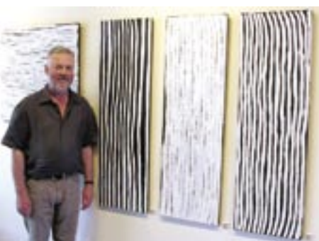
AM 3172/05, AM 2423/05, AM 3165/05 Water Dreaming 2005

She depicts the running water associated with the storm that created this country. Lightning and thunder feature as she speaks of this special place, but she is concerned primarily with the water as it forms creeks and streams and falls to the ground as rain drops.