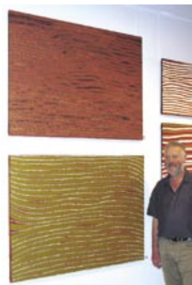
AM 2739/05, AM 2737/05 Kalipinpa 2005