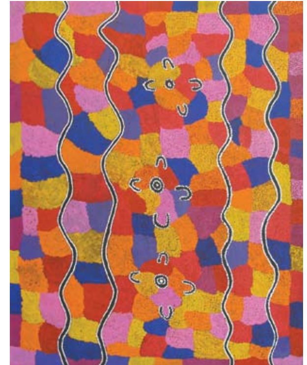
AM 5441/07 Tilau Nangala Water Dreaming 2007 Acrylic on linen 1220 x 1520mm $3850 This painting depicts the women (U shapes) performing a ceremony associated with the many water dreamings from the Papunya area. The circles are an important water or rock hold sites and the sites where the women are holding their ceremony. The black lines represent rain as well as water flowing from the waterholes, flooding the dry landscape. The background represents the landscape in that particular area.