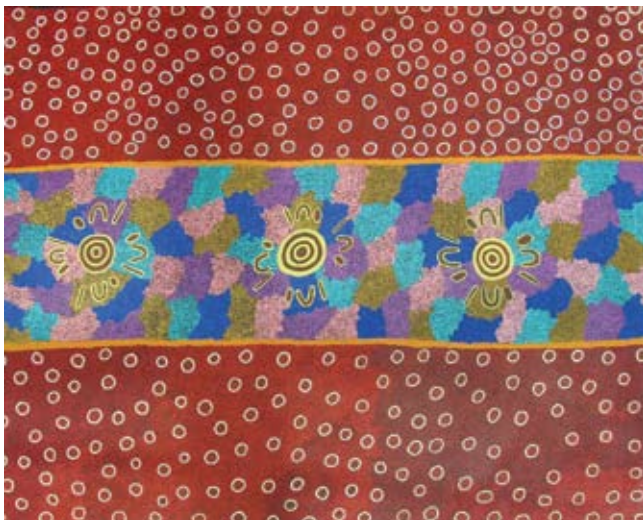
AM 5442/07 Punata Stockman Nungurrayi Women's Dreaming - Women Digging Sweet Potato 2007 Acrylic on linen 1220 x 1520mm $3850 Punata has painted her father's, Billy Stockman dreaming associated with Mt Dennison. The women are represented by the U shapes and are sitting around a rock hole where water collects. Next to the women are their digging stick – wana and wooden dish used for carrying items and digging. The small brown circles are the holes dug by the women in their search for sweet potato.