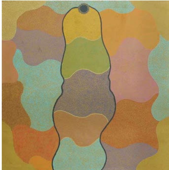
AM 5439/07 William Sandy Emu Dreaming at Kaanpi 2007 Acrylic on linen 1220 x 1220mm $2750 In this painting William has the dreaming associated with the country around Kanpi in the Anangu Pitjantjatjara Yankunytjatjara Lands in South Australia. It tells how the emu ancestors crossed the lands creating living things and the topography we see today. The circle is a rock hole where the emu stop to drink. The black lines are the traditional paths or tracks travelled by the emu.