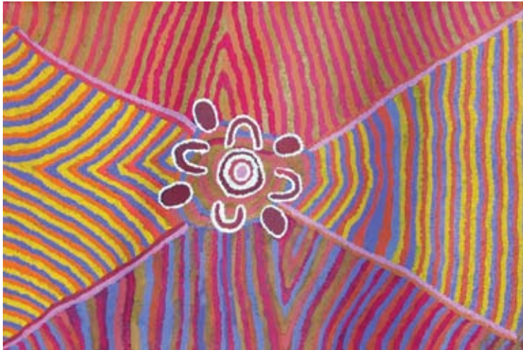
AM 5434/07 Daisy Leura Nakamarra Two Napanangka Women 2007 Acrylic on linen 610 x 915mm $715 Daisy said this is her mother's story about two Napanangka sisters travelling across from Pikilyi from the east to Papunya. They perform inma or ceremony as they travel and eventually head northwest. A traditional ceremony involved dancing and painting their breasts, chest and forearms in ceremonial body designs. They would also decorate their bodies with feathers and dance with ceremonial objects such as nulla nullas (a fighting stick also used for ceremonial dancing).