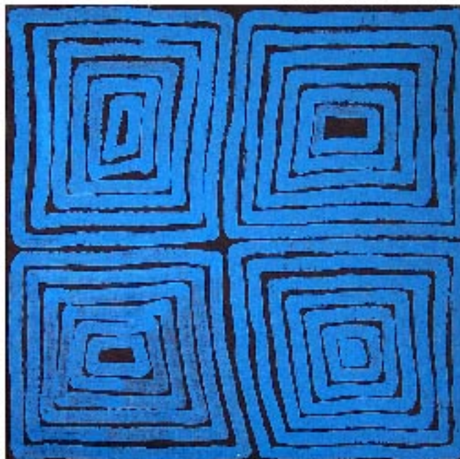
AM 1361.03 Tingari Squares 2002 495 x 500mm $1510