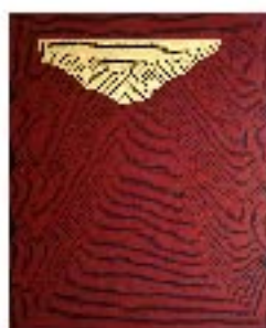
AM 1588.04 Rain Dreaming 2004 1280 x 1580mm $16700