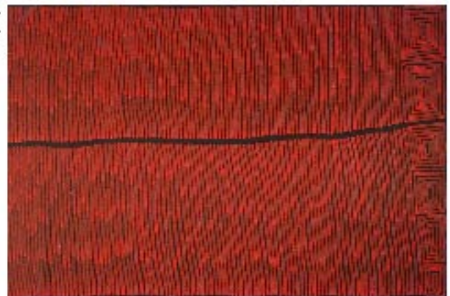
AM 1621.04 Fire Dreaming 2004 1220 x 1820mm $18500