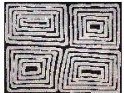
AM 1365.03 Tingari 2002 405 x 505mm $935