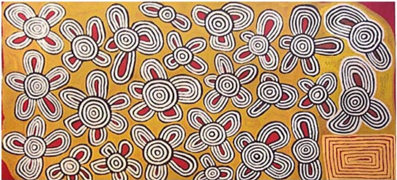
AM 1330.03 Tingari Cycle (Body Design) 1997 920 x 1830mm $12500