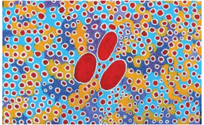
AM 5549/08 Isobel Major Yumarri - Grandmother's Country 2007 Acrylic on Belgian linen 505 x 760mm $620 Isobel has depicted the country belonging to her Grandmother. Two of the red oval shapes are rock holes where water collects. The other red shape is a cave where a man lived. The smaller red circles represent traditional food such as bush raisins and tomato.