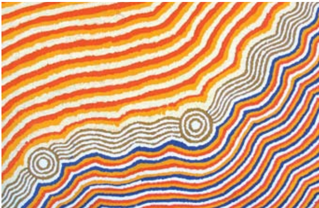
AM 5545/08 Marina Jurrrah Nungarrayai Lupul 2007 Acrylic on Belgian linen 610 x 915mm $850 Marina said she has painted her mother's dreaming, Lupul, north of Kintore. The circles represent important water or rock hole sites and the lines connecting the circles are the creeks or the water flowing across the lands. The white and pink lined areas are the sand hills. The rock holes collect the water during the rains. Knowledge of where to find water was handed down from generation to generation to ensure survival in the desert.