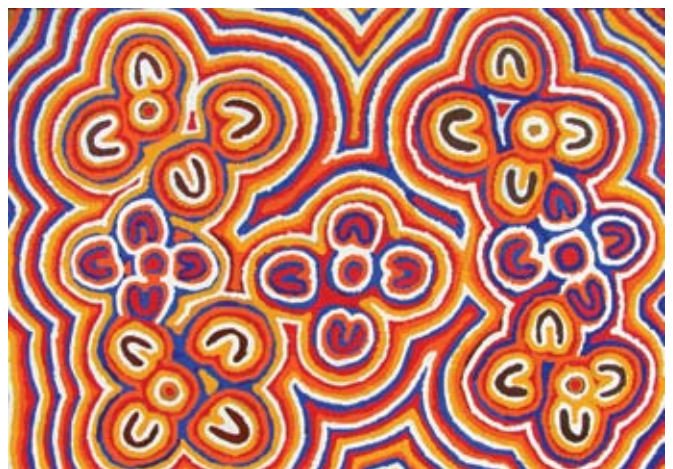
AM 5554/08 Tilau Nangala Women's Ceremony 2007 Acrylic on Belgian linen 915 x 1220mm $4000 This painting represents the women performing a traditional ceremony. The circles are the sites where the women are holding their ceremony. These circles may also indicate water or rock holes where water can be found. The background lines represent the landscape in that particular area and can depict body paint designs used for ceremonies. The women perform a traditional ceremony in honour of their Ancestors where they dance and paint their breast, chest and forearms in ceremonial body designs. They also decorate their bosies with feathers and dance with ceremonial objects such as nulla nullas (a fighting stick also used for ceremonial dancing).