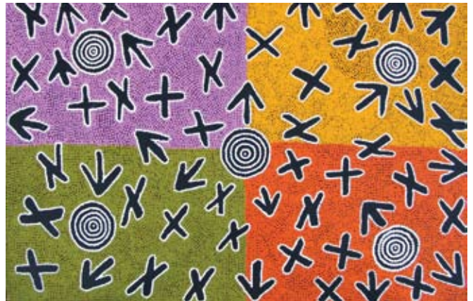
AM 5547/08 Maggie Major Nampitjinpa Budgerigar Dreaming 2007 Acrylic on Belgian linen 610 x 915mm $850 This painting depicts a journey of the Ancestral Budgerigar spirits who travelled from east of Yuendumu across Central Australia during the Dreamtime world creation period. They performed ceremonies and various other secret/sacred rituals in which the landscape was created and modified to what it is today. The important ceremonial sites of the Budgerigar ancestors are depicted by the four circles.