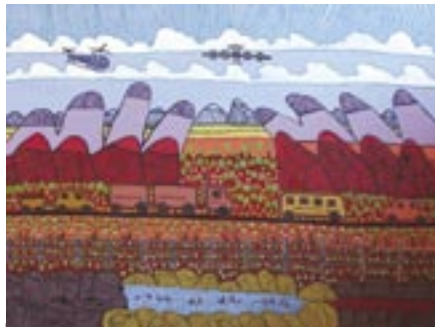
AM 3623/06 Busy Road - Stuart Highway 2005 Acrylic on Belgian linen 910 x 1220mm $5400 Iris enjoys painting the things she sees around Alice Springs. She often travels out bush to Areyonga where her family lives and she likes to depict what she sees along the way - the roads that are busy with tourists or transport trucks and the surrounding countryside and hills with kangaroos and birds.