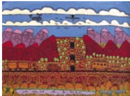
AM 3153/05 Northline - Turn off to Ayers Rock 2005 Acrylic on Belgian linen 910 x 1220mm $3600 The artist has shown the countryside teaming with life.