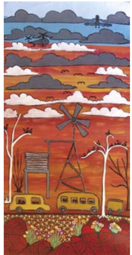
AM 3412/05 Travelling Along the Countryside 2005 Acrylic on linen 500 x 1000mm $1950 Iris likes to paint landscapes that draw on her memories of childhood and her frequent bush trips. She also enjoys sunsets and the evening drawing in, as she has depicted here, with even the birds returning in the evening light