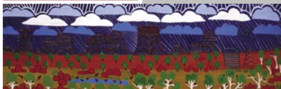
AM 2729/05 Wet Season in the Outback 2005 Acrylic on Belgian linen 380 x 1220mm $1950